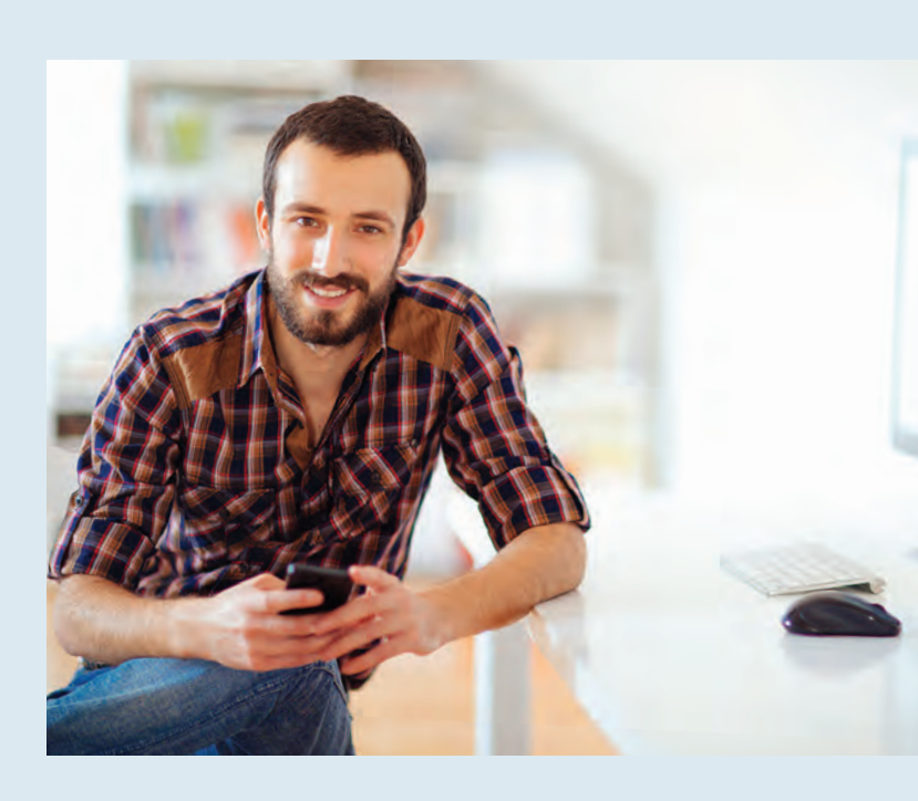
"As a small business owner, YOUR kPlan is a great option for retirement saving that I can provide for my employees."